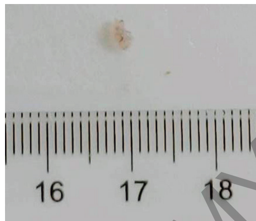
Figure 1. – Macroscopic view of biopsied tissue. Fragment of soft tissue, whitish, papillary in appearance, measuring 0.3 cm.

Based on the results of the histopathological study diagnosis was reached: Histopathological image of squamous papilloma. Vienna classification 1 (Figure 2 and 3).